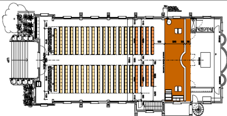
02 GROUND FLOOR PLAN NEW PROPOSED FURNITURE LAYOUT