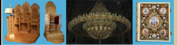
Some of the Icons, Holy Table, Cantor, Bishop's Side Throne, Chandelier, Gospel Cover Stand.